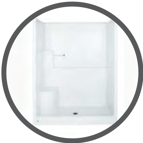
Hytec briward model