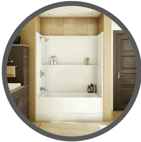
TSEA Plus 105674