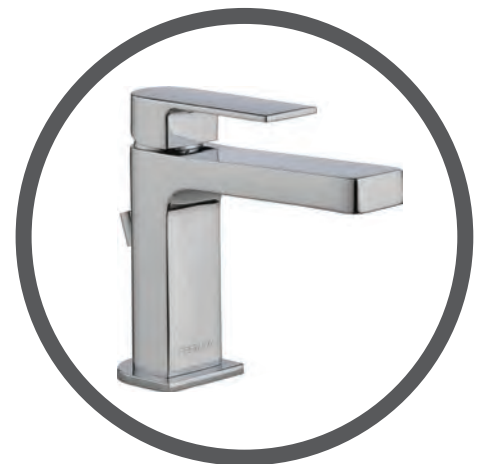
Peerless Xander P1519LF