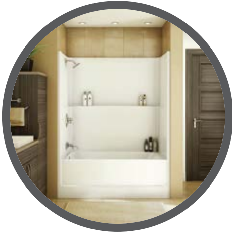
TSEA Plus 105674