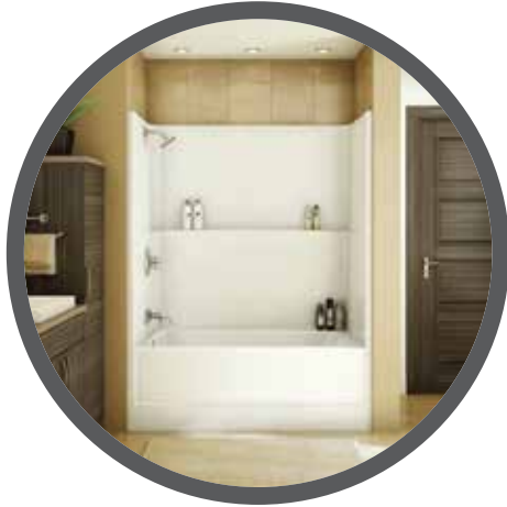
Peerless Xander PTT14419