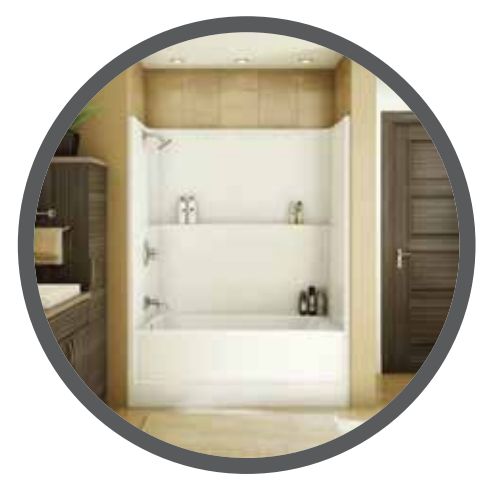
TSEA Plus 105674