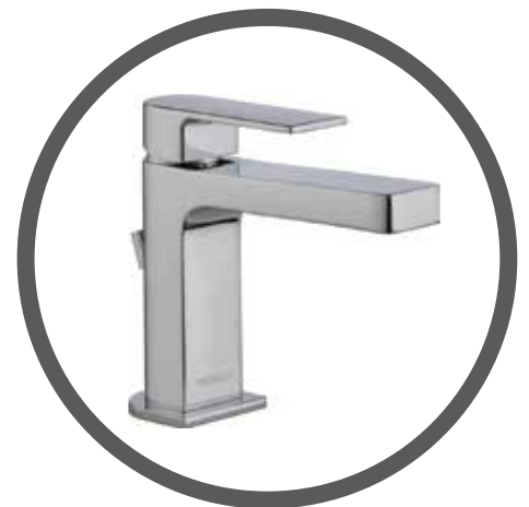
maax CSS36 140007